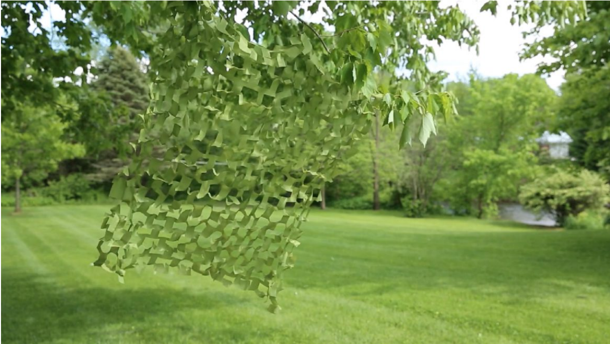
Adrien Sun Hall, Pastoral Desire, 2017, Ripstop nylon, pastoral landscape, wind, sunlight, projected video

Second, in collaboration with the Texas-based nomadic curatorial project Partial Shade , Co-Lab is programming a series of events around a platform constructed on Co-Lab’s newly purchased plot of land in East Austin. Aptly titled A Platform , the monthly events and shows will give artists an outdoor, experimental space to show work. A little more about the project is below, via Partial Shade: