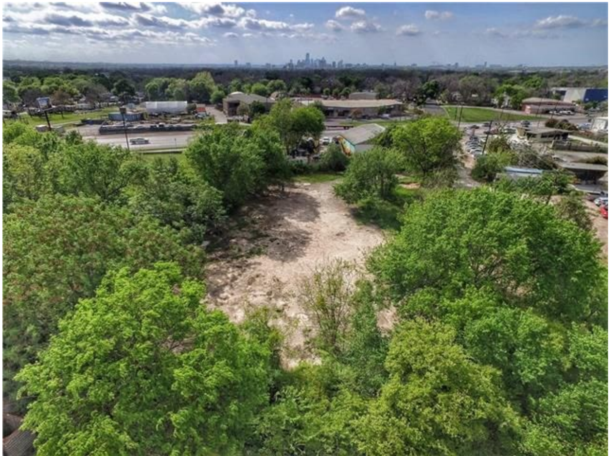
The .62-acre lot at 5419 Glissman Road in East Austin purchased for $365,000 by non-profit Co-Lab Projects.

Co-Lab released a preliminary image of a potential building plan. However, Gaulager said that the organization is only at a very preliminary stage of creating a building plan, project budget and fundraising goal.