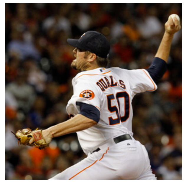
<u>Play Ball! A Guide to This Season's Most-Promising Astros Home Games</u> featured